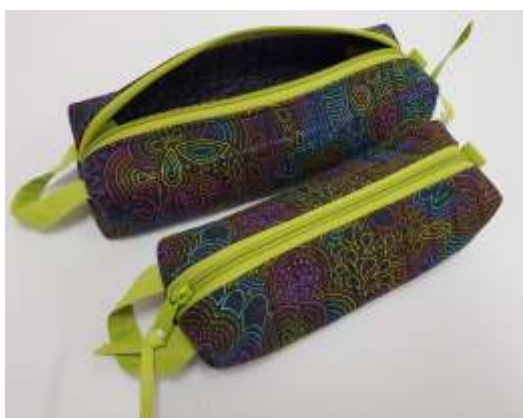
Quick Zip Case Pictured

Class Cost: $55 payable with booking + pattern(s) & supplies.